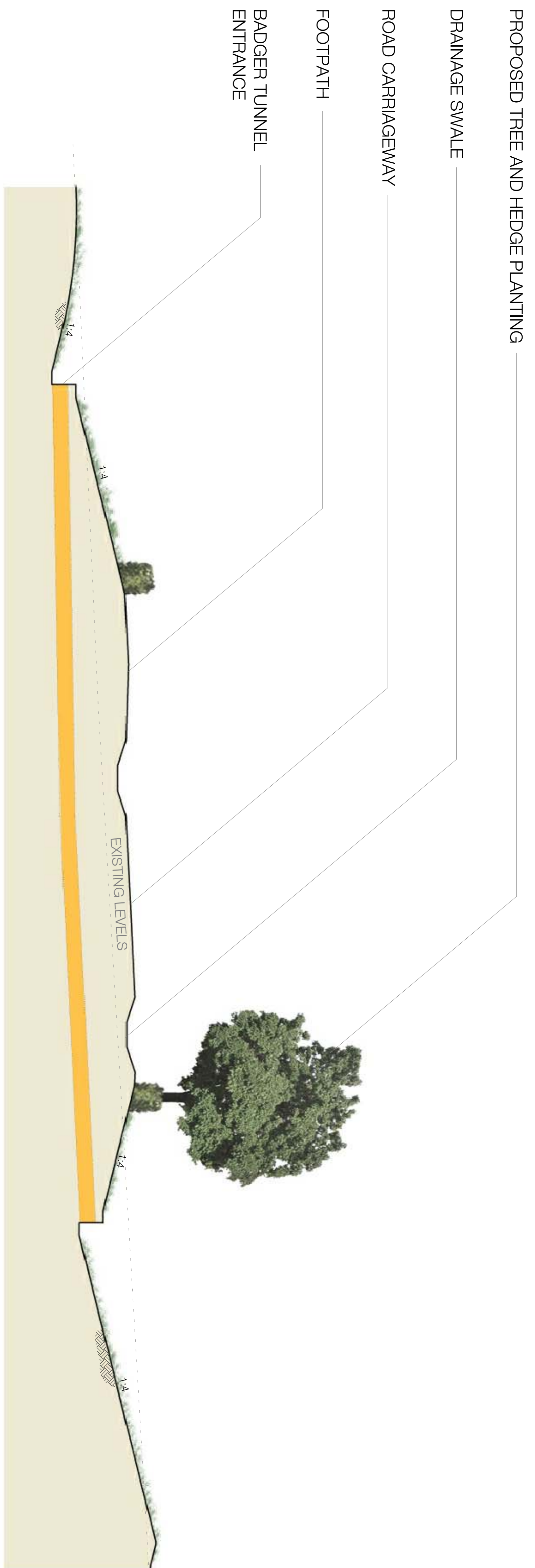
SECTION c - c (CHAINAGE 350)